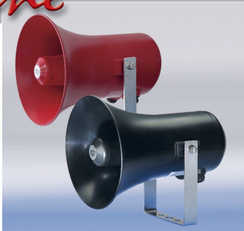
Version with plastic cable gland