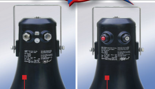
Version with NPT thread